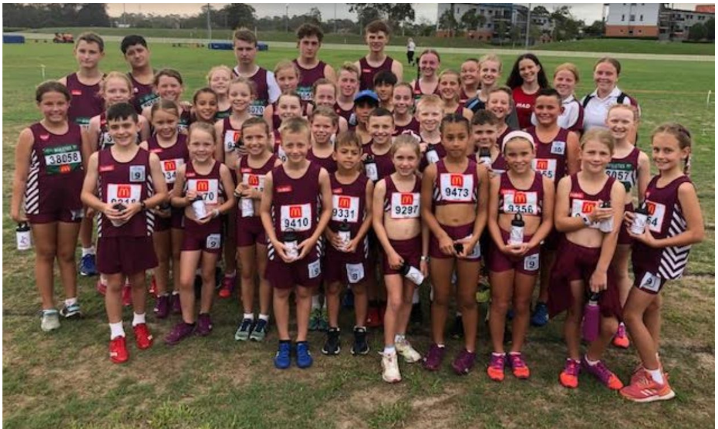
Our 2019/2020 Region representatives