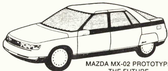
MAZDA MX-02 PROTOTYPE — THE FUTURE —

but it's the After-sales SERVICE you'll appreciate