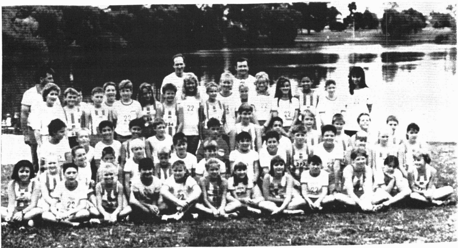
Preston-Reservoir & St. George teams - Melbourne 1990