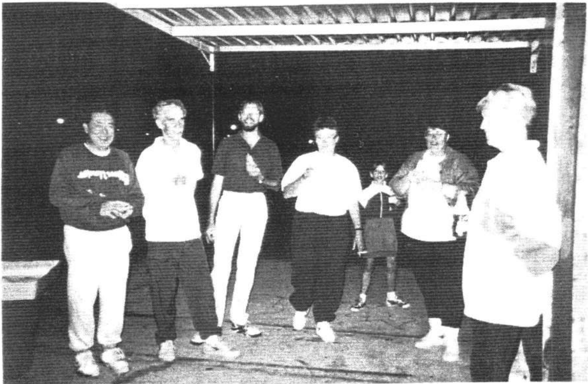
Hard working committee!