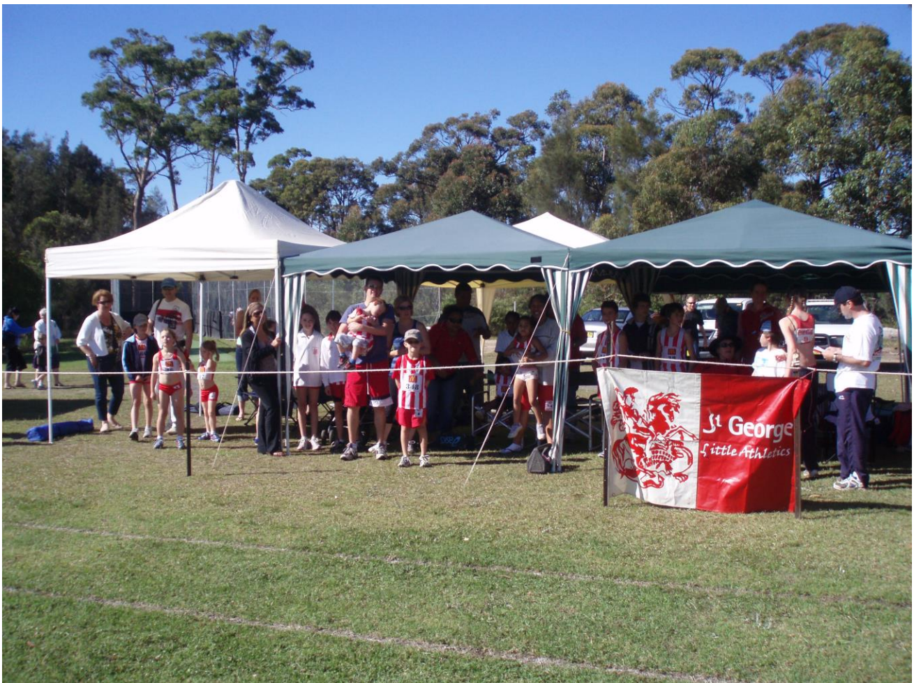
ST GEORGE LITTLE ATHLETICS CENTRE AT THE 2007 DRAGON DERBY CARNIVAL AT SANCTUARY POINT, ST GEORGES BASIN, 11TH NOVEMBER 2007.