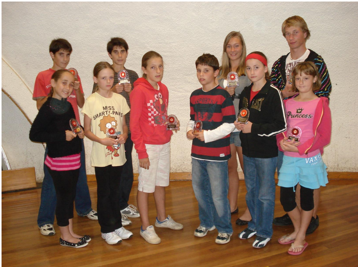
5YEAR AWARD RECIPIENTS WHO ATTENDED PRESENTATION NIGHT 2008