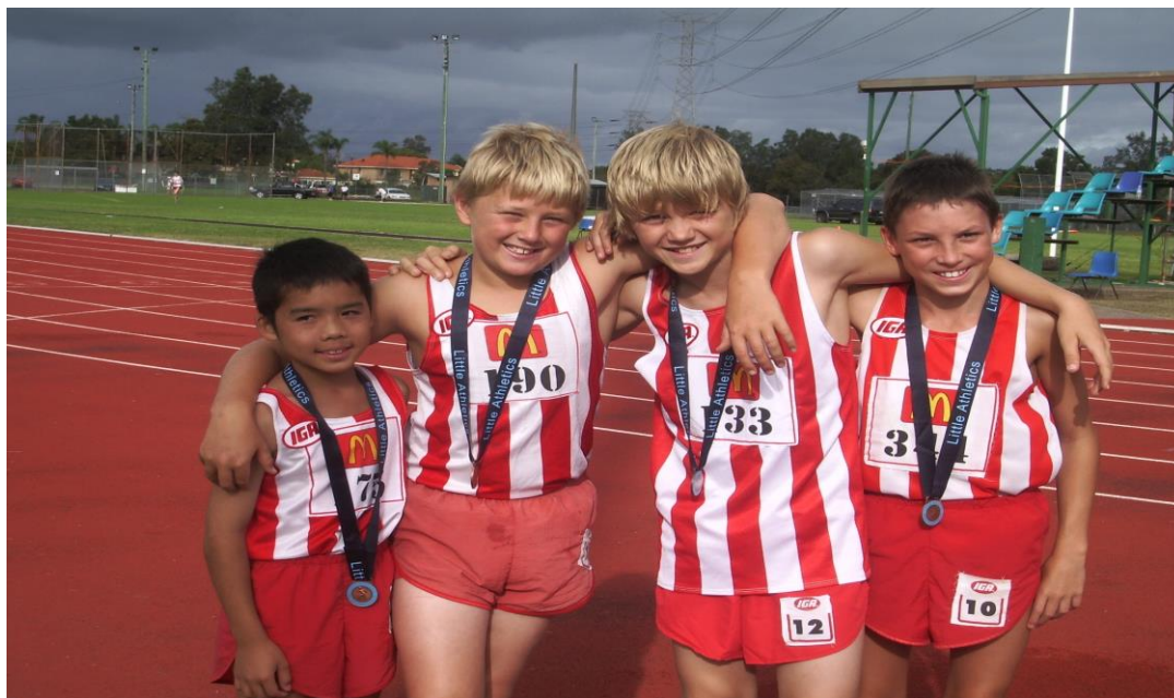
Junior Boys Relay Team, Regional Championships 2008. The team achieved 3rd place.