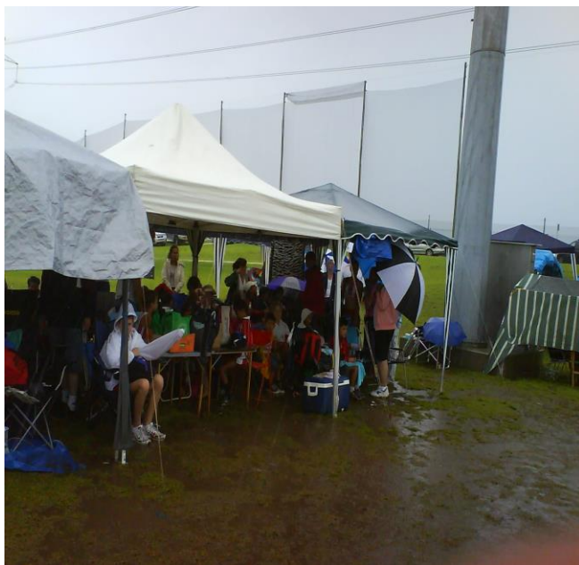
ST GEORGE ATHLETES AND PARENTS EXPERIENCED VERY WET CONDITIONS DURING THE RUNNING OF SUNDAYS 2007/08 ZONE PROGRAM.