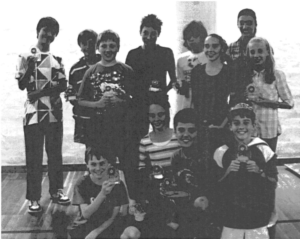
5 YEAR RECIPIENTS AT PRESENTATION NIGHT APRIL 8 TH 2011